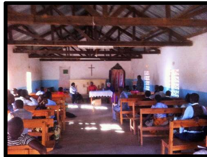
An ever-open door for CFCM at Rumphi

Over the last two years, CFCM has been taking its training to the north of Malawi, and discovered a huge need and desire for more. One pastor told us, "The door is always open for CFCM. We need this training." Our training course has three modules, so we are returning in May for a third time, to complete level 3 in five different centres: Mzimba , Mzuzu , Rumphi , Karonga and Nkhata Bay . In previous years the team travelled by car, but this year they will be using public transport (local buses, minibuses and bicycle taxis) making it a much more tiring and unpredictable tour. Do pray for the team's safety and stamina between 11 th and 22 nd May. On this occasion we will be looking out for enthusiastic and able children's workers who are also potential trainers, to whom we will offer our "Training for Trainers" course later in the year. Join us in praying for guidance in choosing the right people for this – not only capable communicators, but also men and women who share CFCM's passion for reaching children with the Gospel, and with the heart and willingness to make themselves available to continue training in their own region.